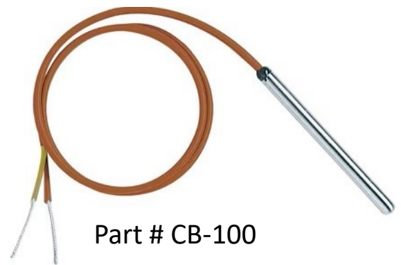
Part # CB-100

The Temp-Sense™ Melt sensor takes the applied pressure (P) by the melt and measures the work applied to the polymer. The actual thermocouple meter readout displayed in our Melt-IQ unit shows the thermal energy being imparted to the polymer instantaneously for a unique “LOOK” into the thermodynamics of the injection unit.